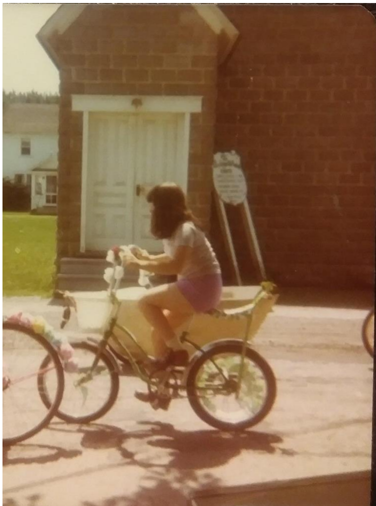
The Reformed Baptist Church of Meductic, New Brunswick

(At this point in my address a document was distributed highlighting a list of just a few of the Kingdom leaders who came out of this Meductic work.)